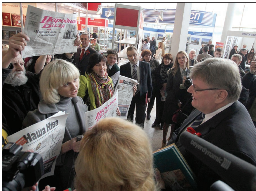
The Minister of Information Aleh Praliaskouski talks to independent journalists who staged a flash mob in support of Narodnaya Volia and Nasha Niva newspapers during Media in Belarus exhibition in Minsk, 4 May 2011

Narodnaya Volia received four official warnings before the appeal. The last one was issued for an article called “Goebbels-TV is on air” and was a critique of a highly sensationalist documentary broadcast by state television about events after the presidential election of 19 December 2010 in Minsk that accused the opposition of organising mass riots. 44